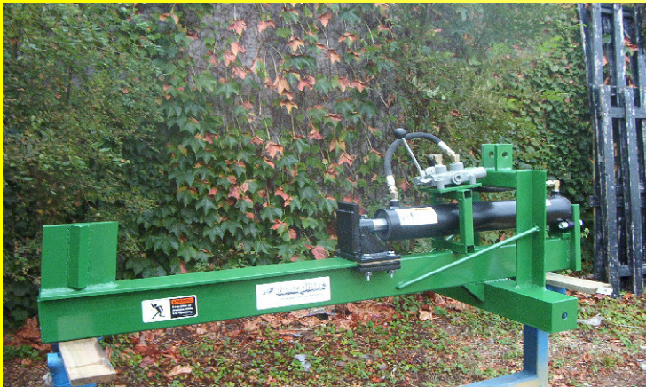
Horizontal 3 point Attachment

The Toughest Log Splitter In the Business